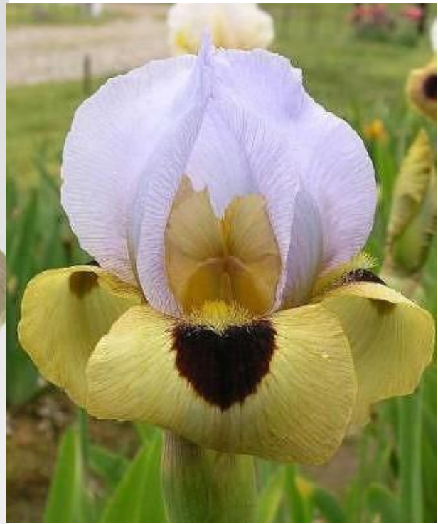
'SILENT SENTRY'