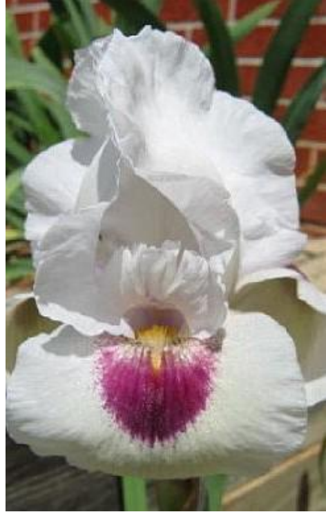
'SHEBA'S JEWEL'