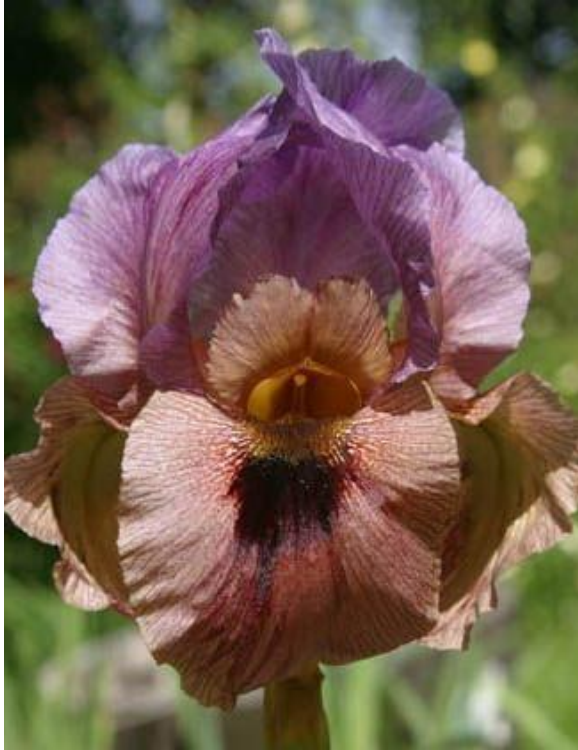
'SOLOMON'S COURT'