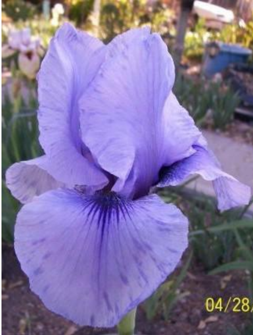
‘MOHR PRETENDER’