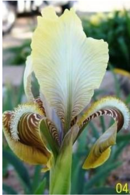
‘TURKISH TOPAZ’