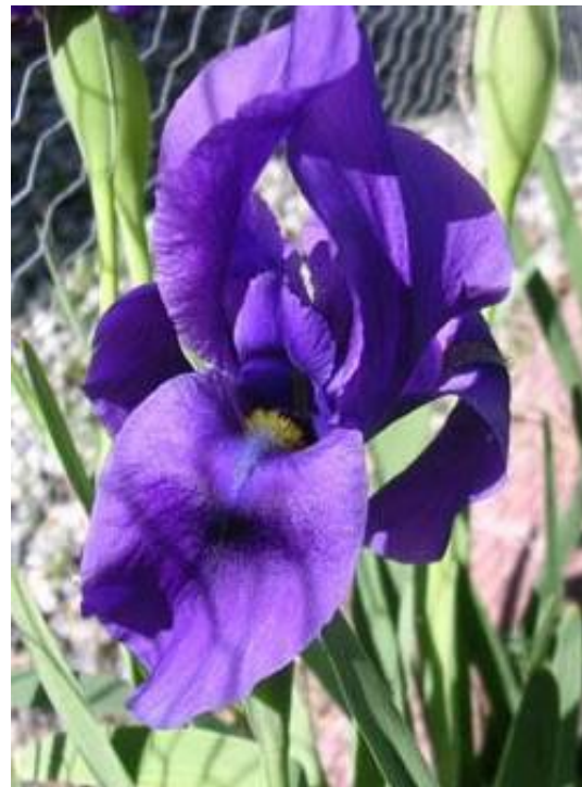
I. hoogiana purpruea