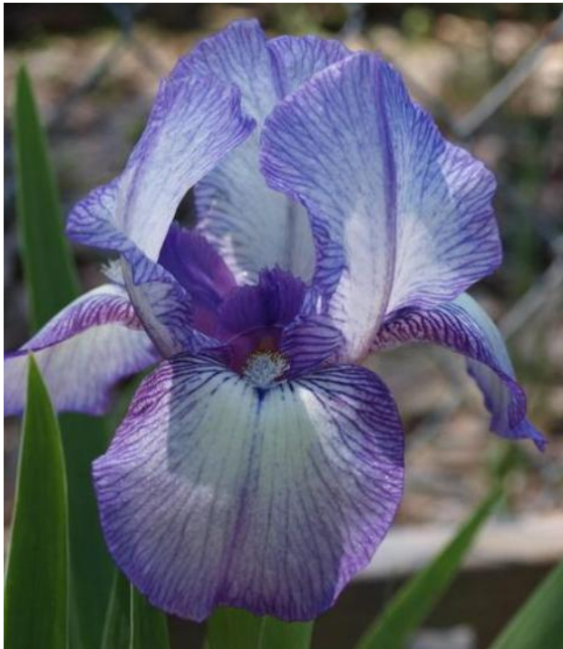
'OMAR'S STICHERY'