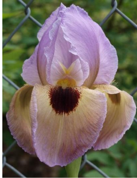
'RIVERS OF BABYLON'