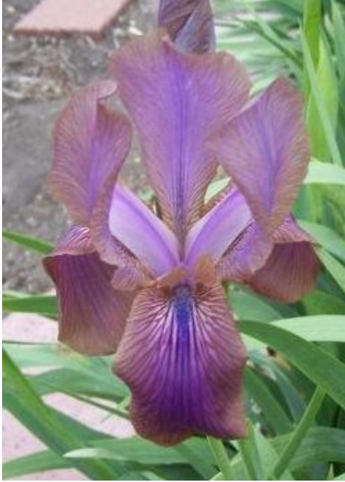
'BEDOUIN CHILD'