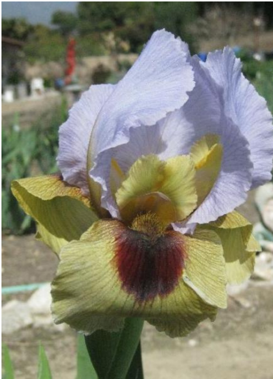
‘LUELLA DEE’