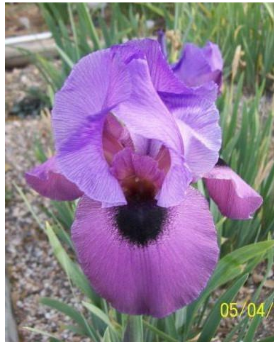
'PERSIAN PADISHAH'