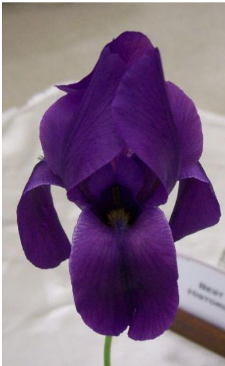
I. hoogiana 'DEEP PURPLE'