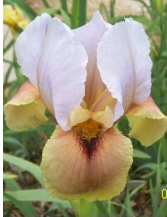
'BEDOUIN WOMAN'