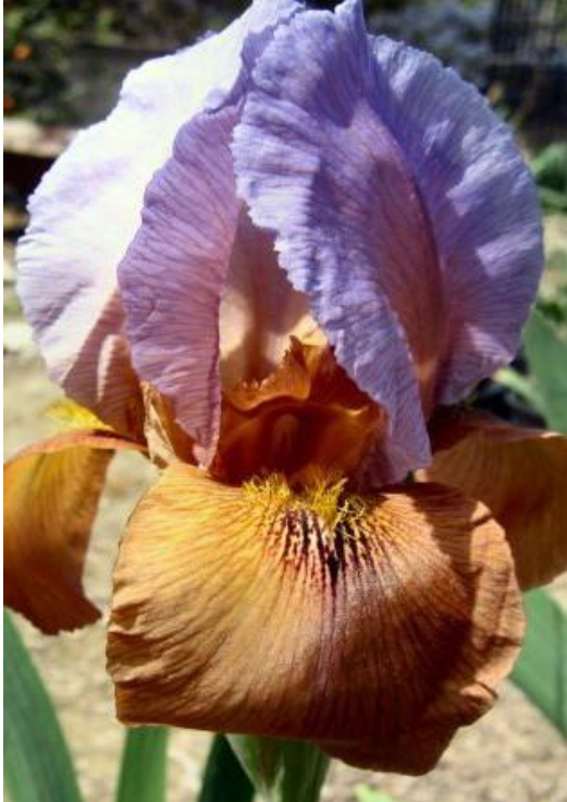
'KING SOLOMON'S MINES'