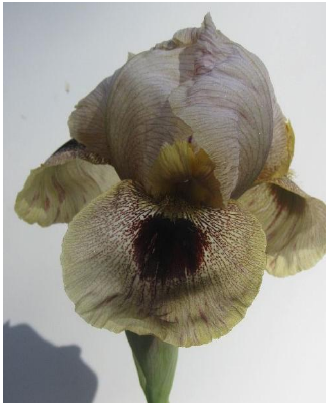
'SANDY DANDY'