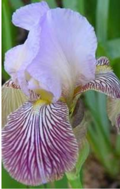
'BEILDERED BLUE BUTTERFLY'