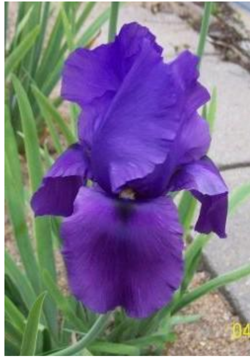
I. hoogiana 'LATE AMETHYST'