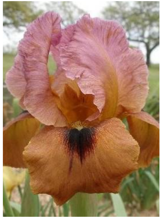
'BABYLOIN FIRES'