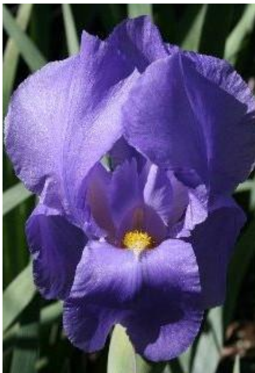
I. hoogiana 'BLUE MOUNT'